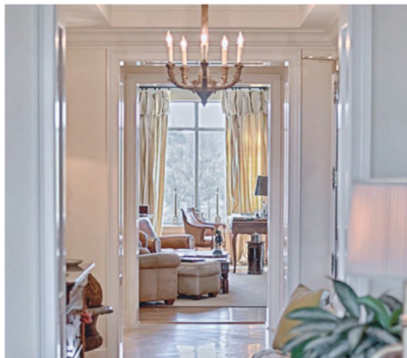
BUCKHEAD, 3286 NORTHSIDE PARKWAY, ATLANTA 30324 Sophisticated top floor 3br/3.5 with den Residence at Borghese. Great boutique building, only 52 total homes! 24hr concierge, grand lobby, enchanting rooftop terrace Just Listed $1,100,000

Prior to launching her own firm in 2016, Rodriguez ranked as the third highest individual producer at Dorsey Alston, the number one firm in Buckhead. She ended 2015 with $30M in closed sales. Karen is frequently quoted in publications like the Atlanta Business Chronicle , Forbes and Yahoo Real Estate .