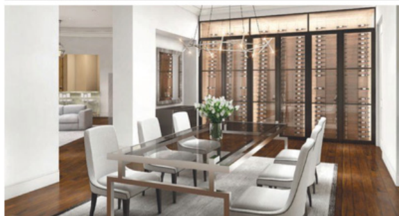
NEW CONSTRUCTION 2016! BUCKHEAD, RESIDENCE #52 3376 PEACHTREE RD. Brand new Harrison designed full floor 4br/4.5 on higher floor at Mandarin Oriental Listed for $4,300,000